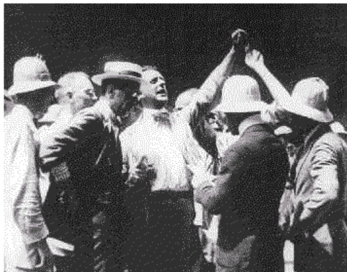
Curbstone brokers in the 1920s

Extensive graphics ... Ideal for personal reading, gifts, investment clubs, the classroom, libraries, and employment training.