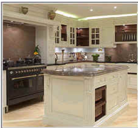
Kitchen remodeled last year